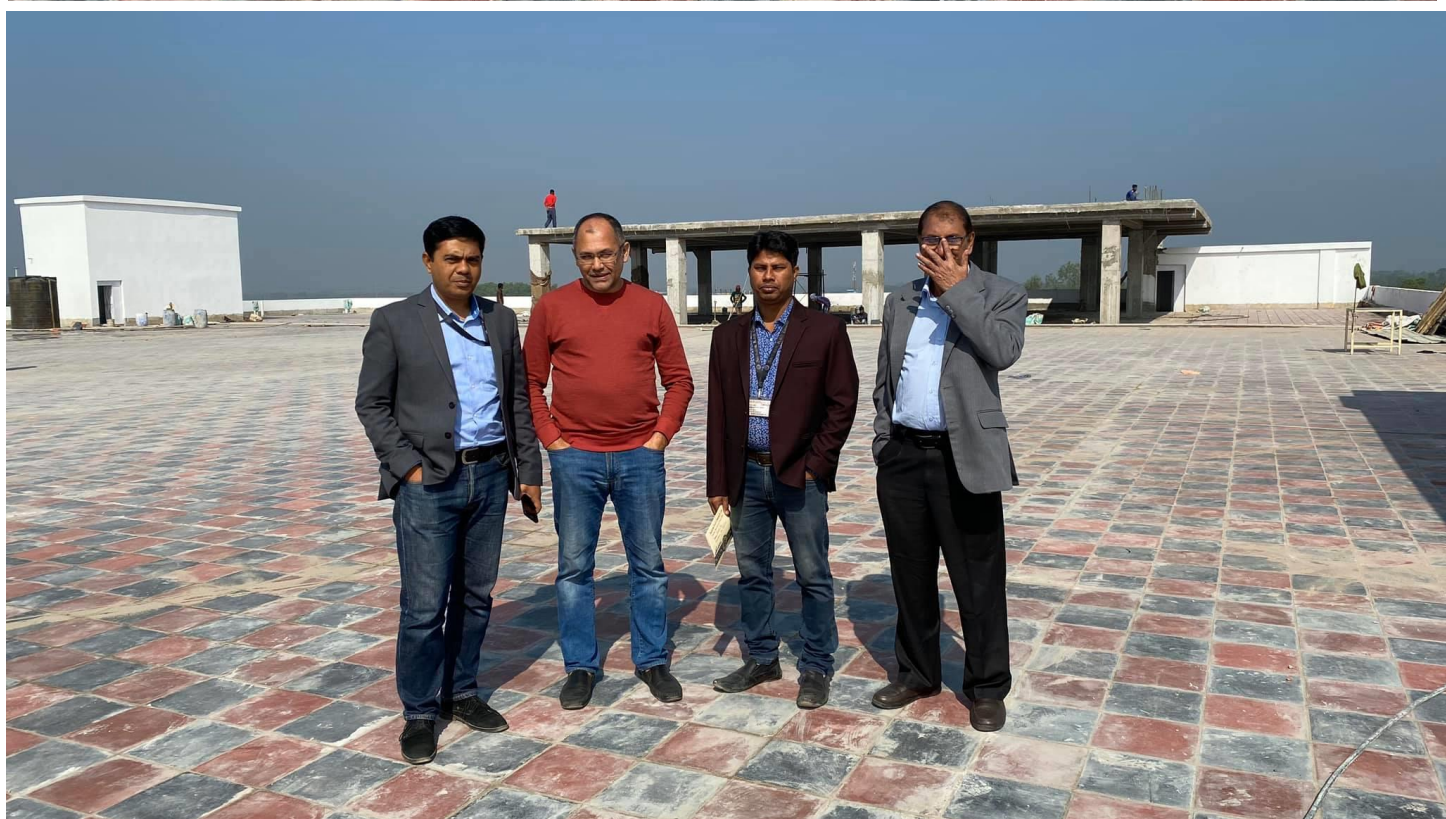
Bashundhara Main Gate, Bashundhara, Dhaka-1229, Bangladesh